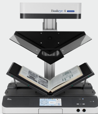
Option: V-glass plate