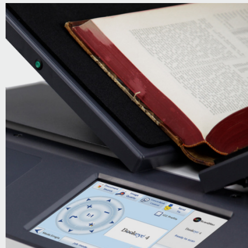
Book cradle in 120° V position.