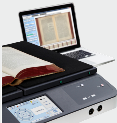
Bookeye® 4 V2 Professional with scan client.