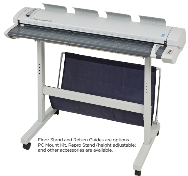
Floor Stand and Return Guides are options. PC Mount Kit, Repro Stand (height adjustable) and other accessories are available.